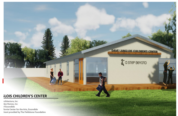
ILLOIS CHILDREN'S CENTER Architecture, Inc. San Marcos, Inc. of Escondido Family Center for the Arts, Escondido Grant provided by The Tidestone Foundation